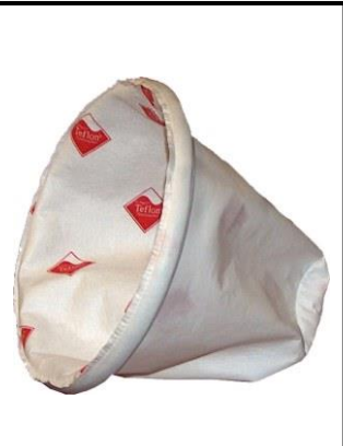
HEPA SELF CLEANING FILTER