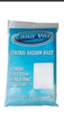
OPTIONAL BAG SYSTEM